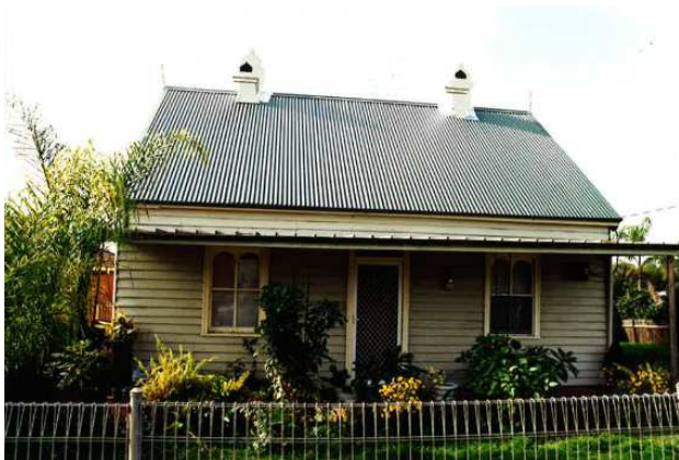
Former cottage, now demolished.