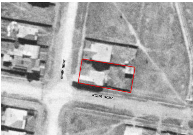
1943 aerial image, showing the former shop and dwelling

The Former Shop and Dwelling (shown in the aerial below) has been demolished. The site has now been replaced with a late twentieth century dwelling of no heritage value (shown to the right).